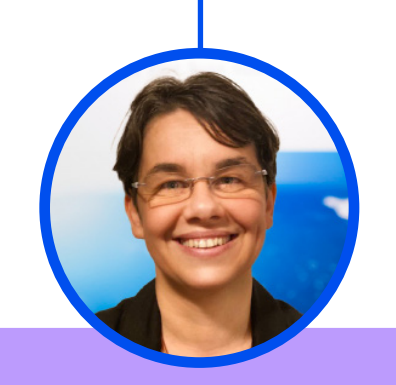
GAS, HYDROGEN & RETAIL

RESILIENCE & FLEXIBILITY NEEDS incl. MODELLING CELL